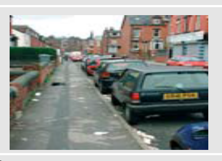
<u>Grade D</u> Heavily affected by litter and/or refuse with significant accumulations