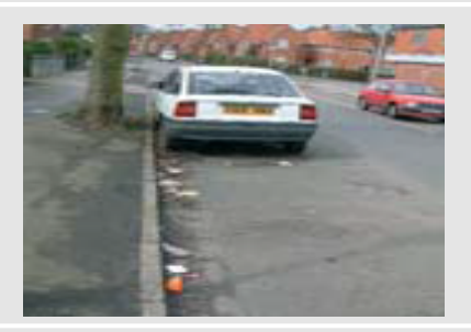
<u>Grade C</u> Widespread distribution of litter and/or refuse with minor accumulations