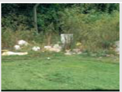
Grade D Heavily affected by litter and/or refuse with significant accumulations