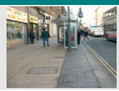
<u>Grade B</u> Predominately free of litter and refuse apart from some small items