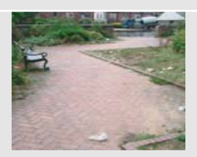
<u>Grade C</u> Widespread distribution of litter and/or refuse with minor accumulations